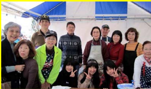
Below: Festival Booth Above: Friends of ours.

Members of Sister City worked in our Japanese Garden that was donated by our many friends in Higashimurayama over 20 years ago. Serving as Clean-up Volunteers started with a Breakfast at the Sermon Center sponsored by the City, followed by making the Garden a Place of Beauty.