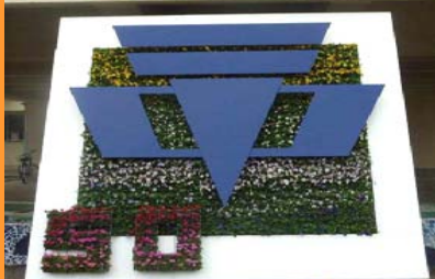
HIGASHIMURAYAMA 2nd JUNIOR HIGH SCHOOL SINCE 1960 — 創立50周年記念 —

Entertainment at the celebration was the dynamic performance of Taiko Drums pictured on the right. If you have heard these drums at the Cherry Blossom Festival or Kansas City Japan Festival, you know how dramatic they can be.